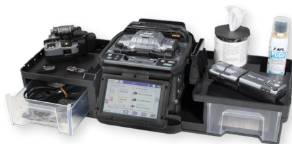
In Work Tray

The Fujikura 90R is the mass fusion splicer workhorse of the splicing world. As data demand continues to rise, the solution to handle the increased traffic is to increase fiber counts. As a result, fiber counts being utilized in enterprise data centers, campus, and metro networks have grown enough to make single fiber splicing too costly and timely. High density cabling made possible by SpiderWeb Ribbon® (SWR®) and others like it are spurring ribbon splicing activity in places that have traditionally used loose fiber. The 90R is the answer to these changes in splicing demand. With automated splice start, tube heater, wind protector, cleave tracking, and blade rotations for up to 2 cleavers at a time, this splicer frees up operator time for other fiber preparation steps. New to the 90R, you can keep your splicer in the field longer with field replaceable V-grooves. When V-grooves can no longer be cleaned after extended use, or are accidentally damaged, you can resume splicing in minutes by installing the spare set included with your 90R kit. Put our 90R to the test by contacting us to see its capabilities first-hand, 1-800-235-3423.