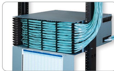
ASCEND 4RU front