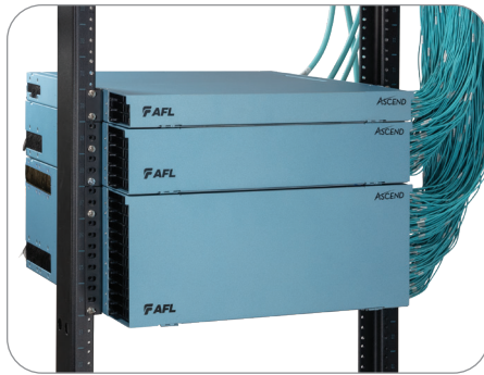
ASCEND Fiber Housings in Rack