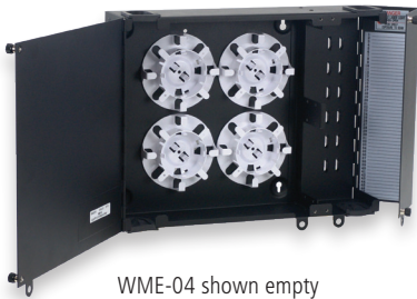
WME-04 shown empty

AFL's wall mount interconnect enclosure (WME04) provides a convenient convergence point for interconnecting and/or splicing in wall mount applications. Provisioned for up to four LGX compatible adapter plates or optical modules, the enclosure features a well-engineered solution for fiber and cable management on both the ingress and egress openings of the enclosure. Robust steel construction ensures the highest level of protection for sensitive components while integrated roll-formed hinges eliminate possible fiber pinch points while deploying or servicing components within. The WME04 features discrete access doors for provider and customer access which are independently lockable with a common pad-lock or tube-style keyed lock.